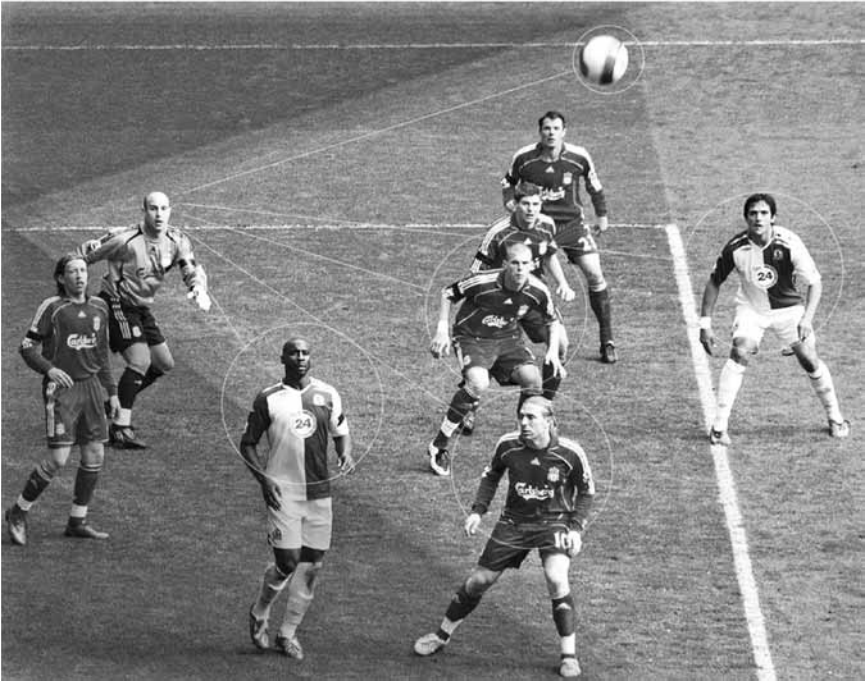
Figure 2 — Illustration of several core principles from a goalkeeper's (GK) perspective during live action that relates to the perceptual-cognitive task: (a) the GK must track multiple elements, (b) the GK must track these elements using central but also large portions of the peripheral visual field, (c) the GK must efficiently use information from a large area of the visual field, (d) the GK must process all of this information at very fast speeds.

improving the capacity to maintain the tracking capacity of multiple elements theoretically becomes a desirable trait to train. Previous studies have shown that most people can generally track four to sometimes five elements depending on the condition and population (Fougny & Marois, 2006). Healthy adults generally can track four elements, while older adults appear to be limited to three under standard conditions (Trick, Perl, & Sethi, 2005). This ability to track multiple objects in a dynamic sports environment has been identified as potentially important to reacting swiftly and effectively (Williams, Hodges, North, & Barton, 2006). As we will discuss later, when tested on this isolated ability, elite athletes average higher than sub-elite athletes, but with variation, and also with capacity for improvement across all levels.